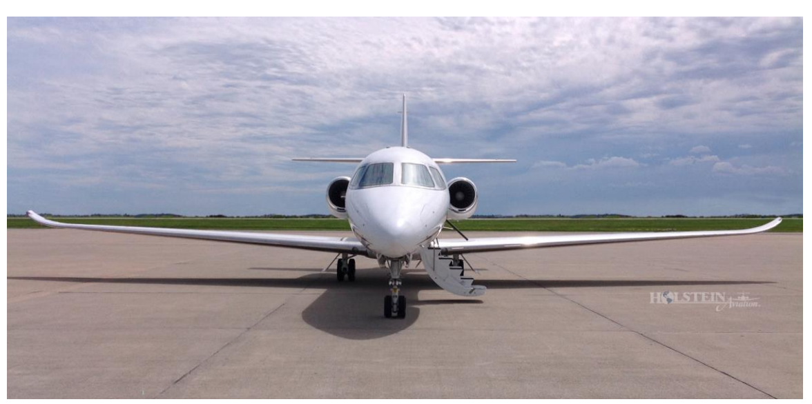
Specifications subject to verification upon inspection. Aircraft subject to prior sale without notice.