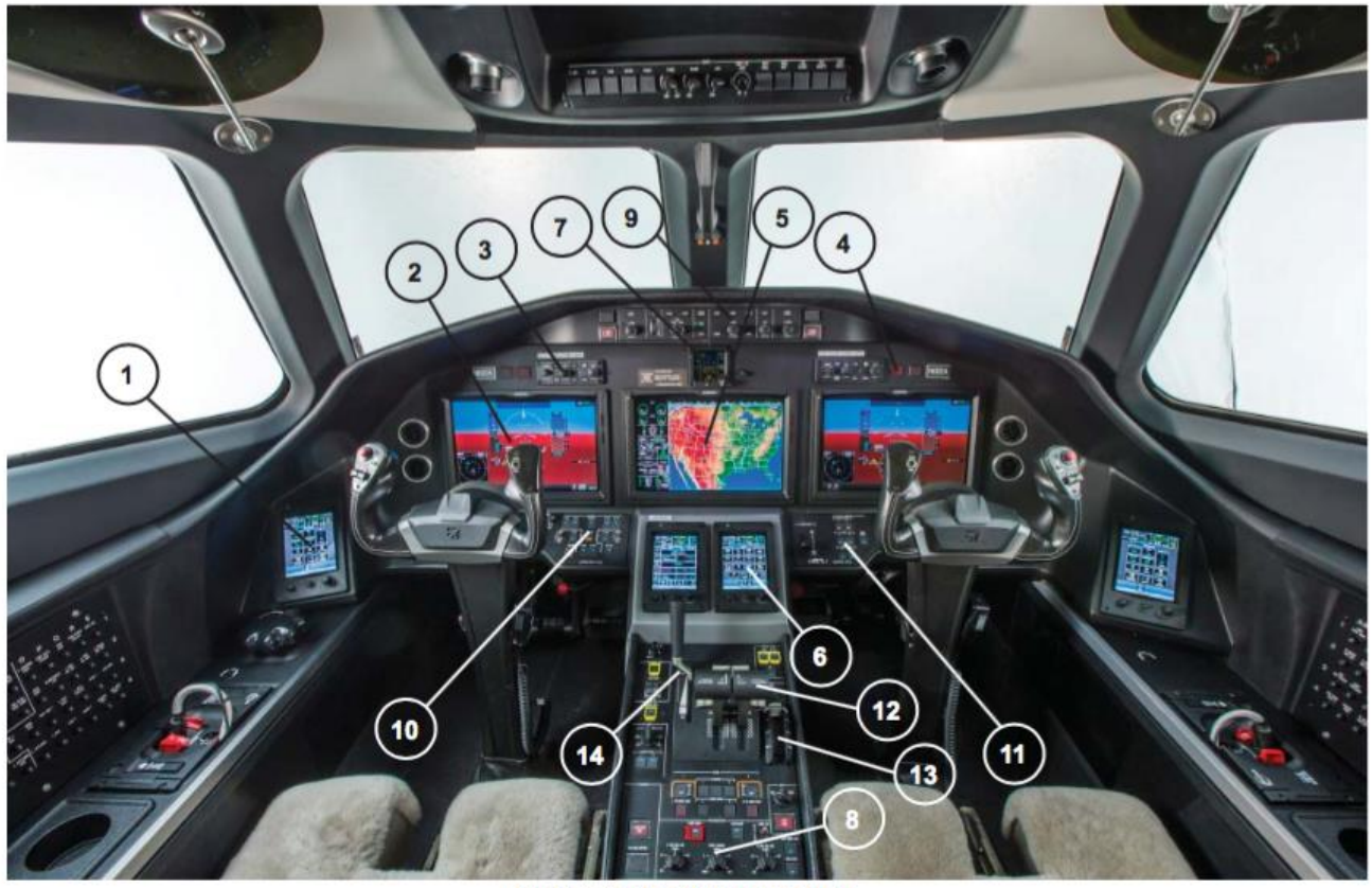
Figure 3: Instrumentation